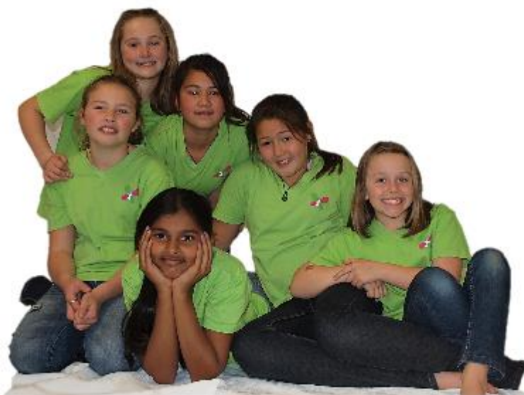
Northpoint girls are the poster girls for our publicity